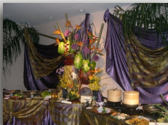
A decorated Thai buffet enhanced the cuisine