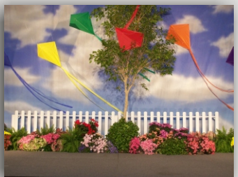
A stage with a spring theme put attendees in an upbeat mood