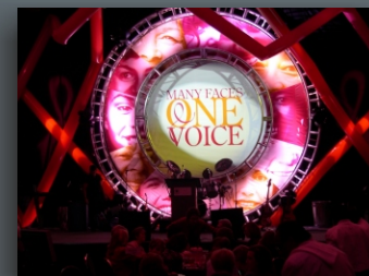
A conference logo becomes a stage design