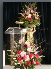
Your lectern can be part of your overall decor.