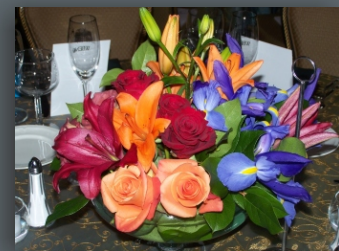
Floral centerpieces are always in fashion