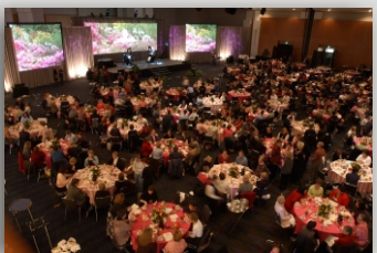
Brunch in a garden there are many ways we can bring the outdoors in